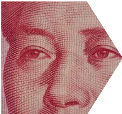
Close Up of 100 Yuan Note