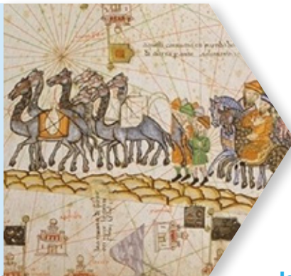
Caravan on the Silk Road by Cresques Abraham. Public Domain.