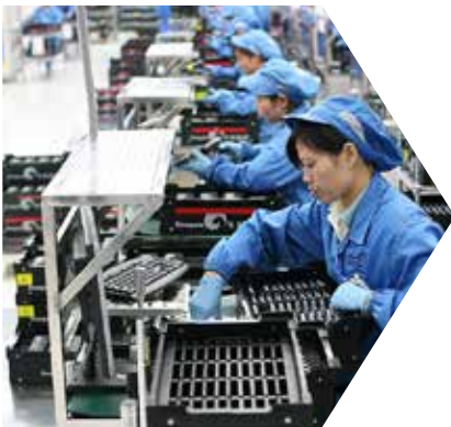
Chinese Workers Performing Quality Assurance