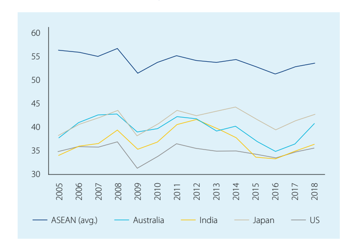
Figure 1. GVC Participation by Economic Area (% of Gross Exports)

\label{eq:assemble} ASEAN = Association of Southeast Asian Nations, avg. = country weighted average, \\ GVC = global value chain, US = United States.