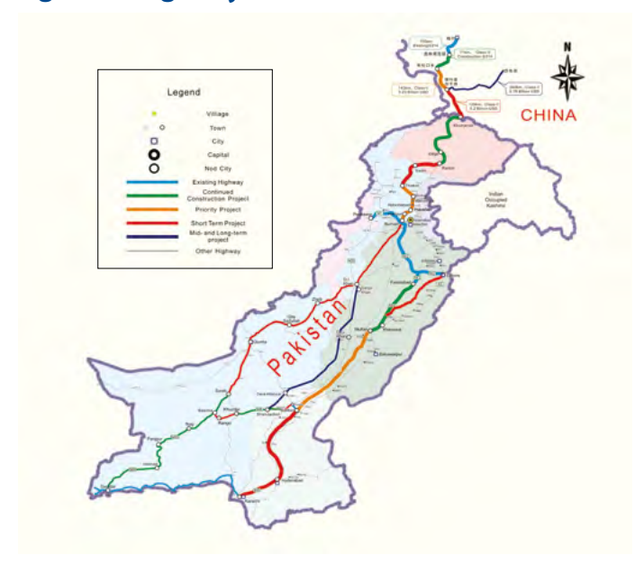
Figure 2. Highways Network of CPEC