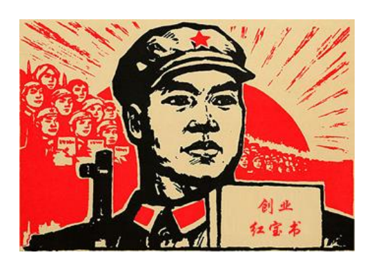
Figure 3. "Overseas Students! ZhenFund Calls You Home to Start a Business"