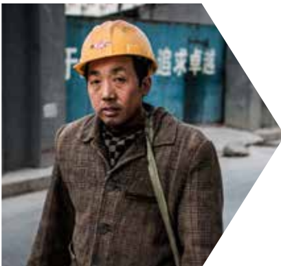
Migrant worker by Matt Ming. BY-NC-SA 2.0 https://flic.kr/p/jpXKnz