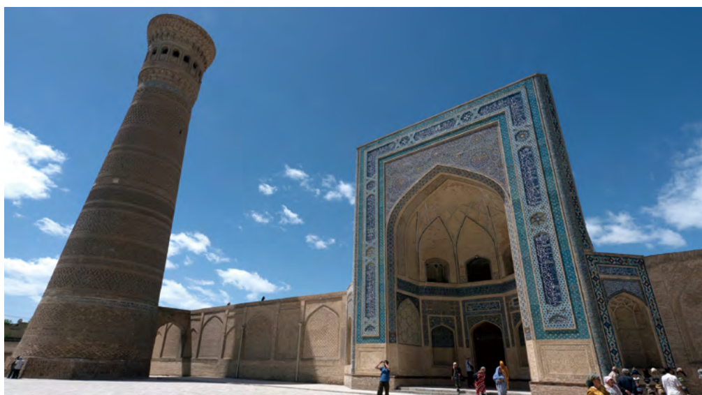
Bukhara, Uzbekistan.